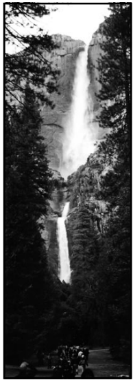
Upper and Lower Falls from our trip to Yosemite National Park.