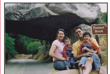
All of us outside Sequoia National Park.